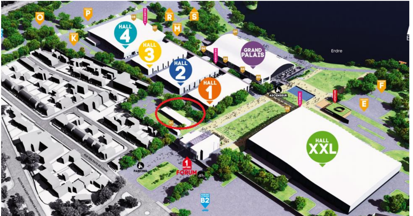
Press Room of the "Parc des Expositions de la Beaujoire » : (red circle)